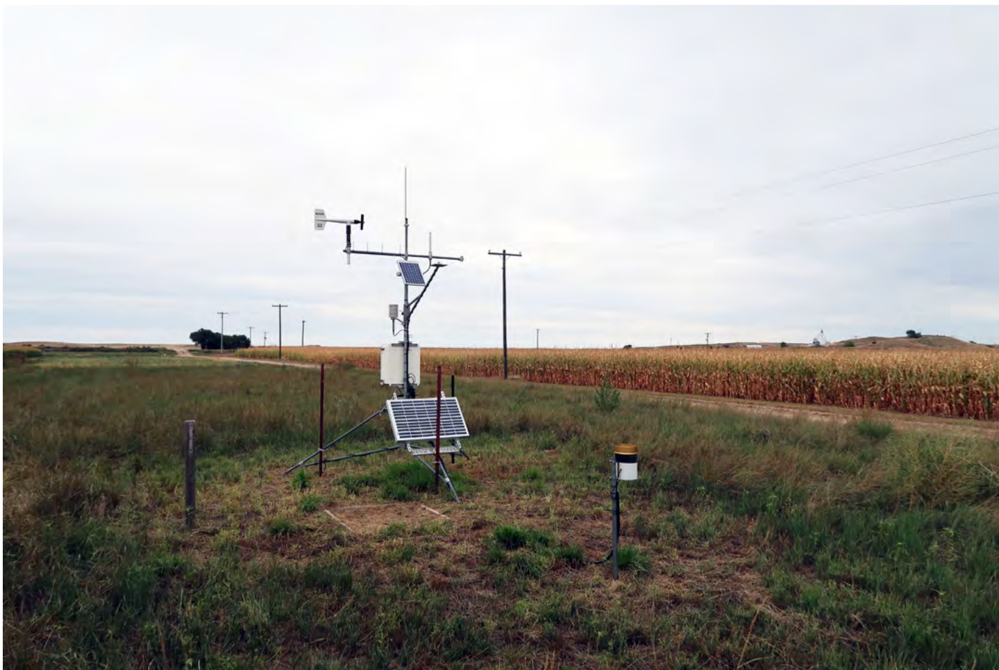
NEBRASKA STATE CLIMATE OFFICE