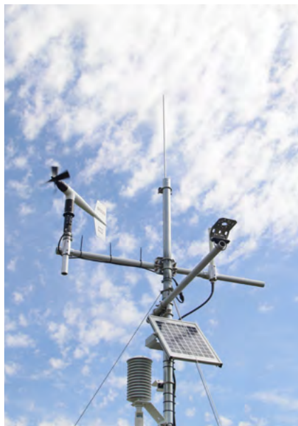
NEBRASKA STATE CLIMATE OFFICE